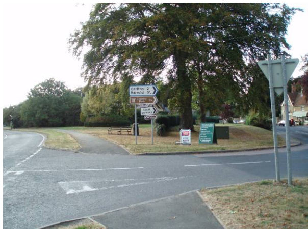
View west from High Street