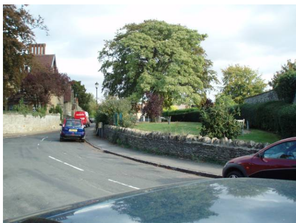
View east from Carlton Road