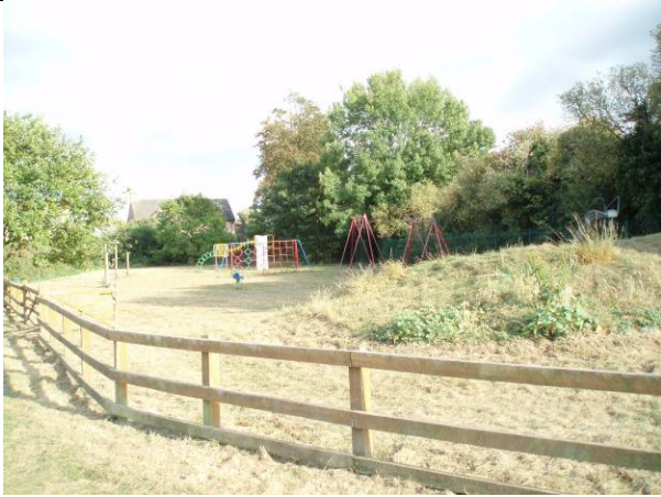
View east towards south eastern corner of site