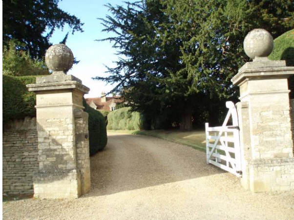
Views from Carlton Road