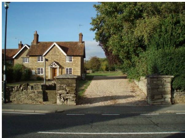
View north from High Street