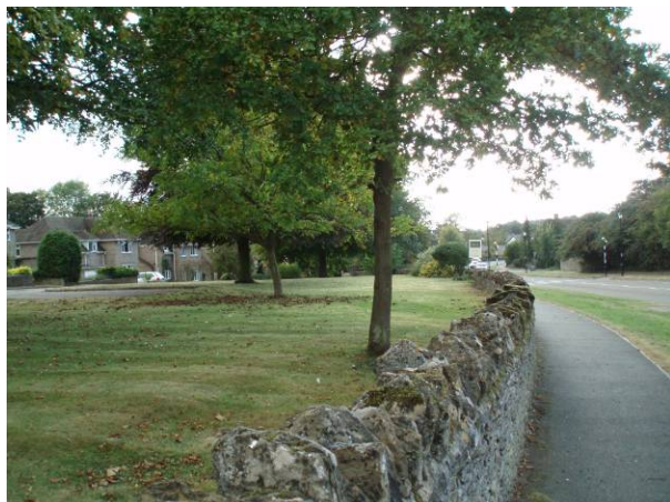
View west along High Street