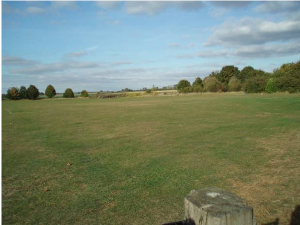
View north across site, from Grove Rd