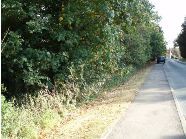
View south along Carlton Road